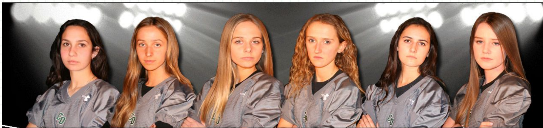
Team Colors - Black Jerseys w/White Lettering