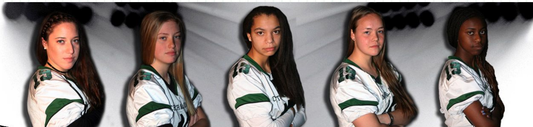
Team Colors - White Jerseys w/Black Lettering