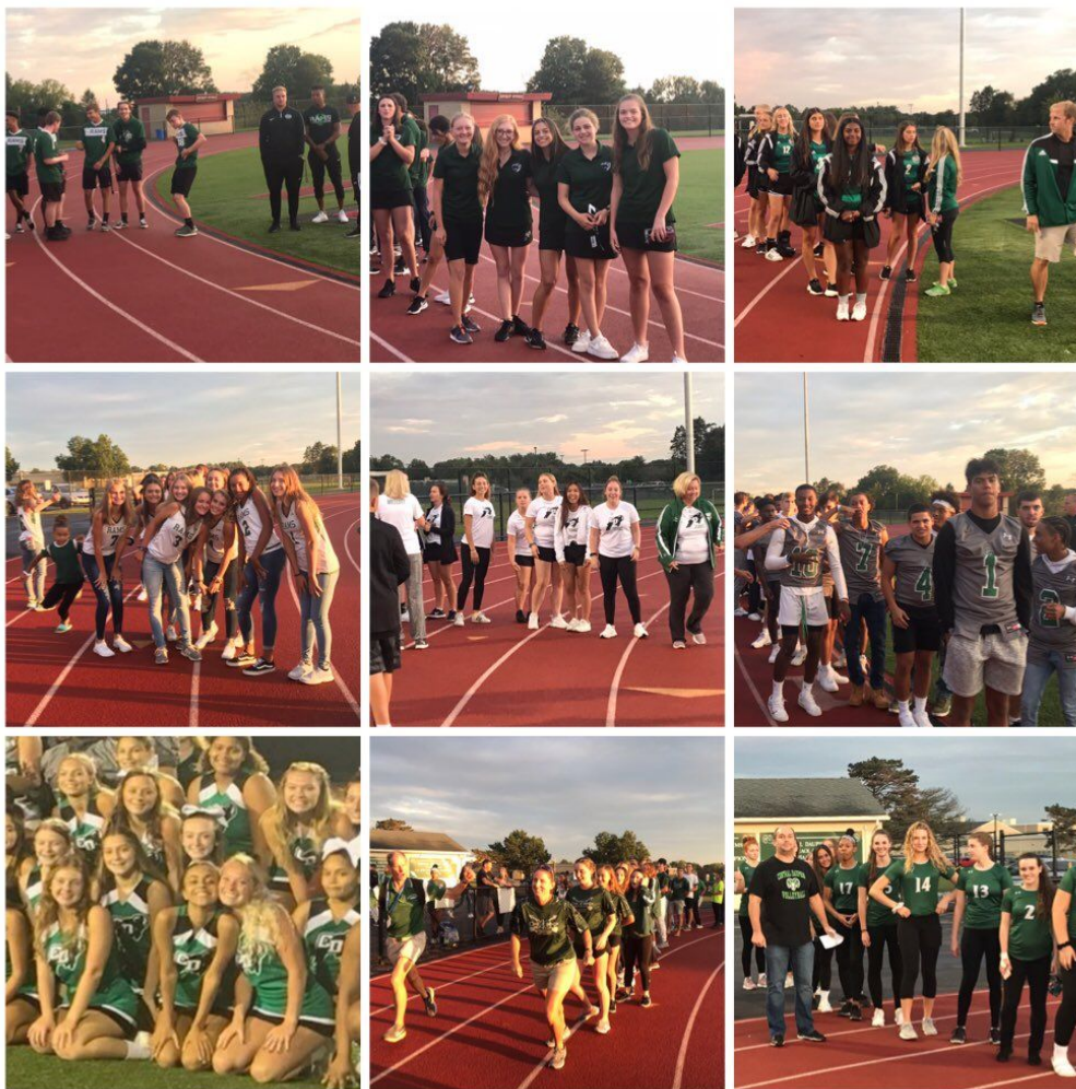
Meet the Rams Night